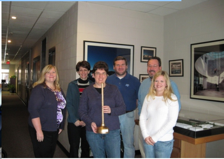
Campus Planning Toiletry Drive Winners