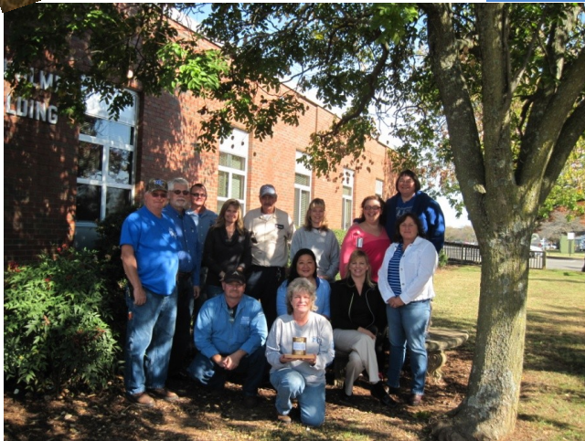
Facilities Services Total 246.71 lbs