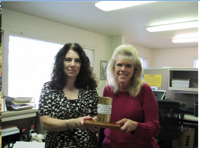
Budget Office 18.57 lbs. per employee