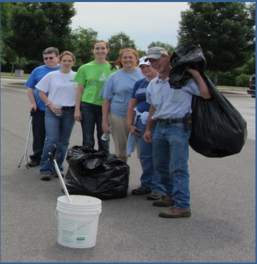
MTSU Facilities staff volunteering for litter cleanup.