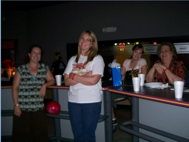
Bowling for Two!